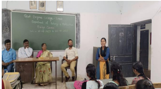
STUDENTS GIVEN BY FEEDBACK ABOUT BRIDGE COUR