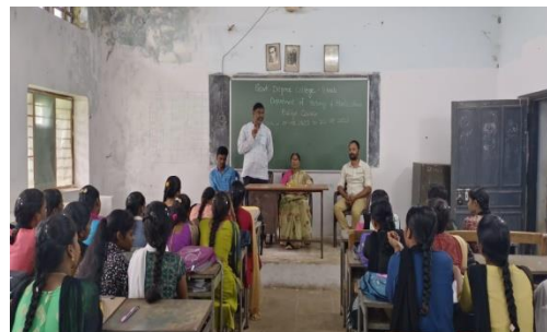
Explaining about bridge course by iqac co-ordinater